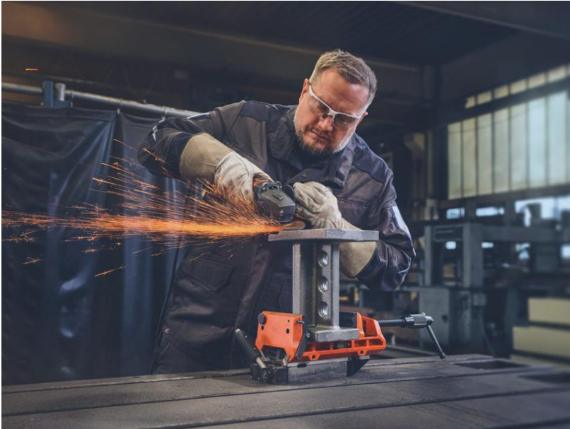
Picture caption: The VersaMAG Vise 160 L can be used as a reliable form of fixation for precise jobs in the workshop.