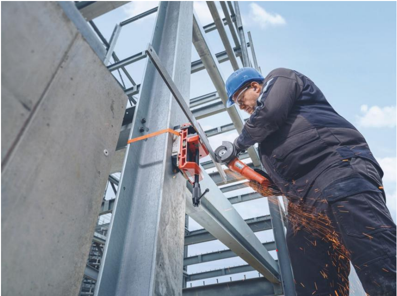
Picture caption: Complete stability even when used as mobile device: the VersaMAG VISE 160 L being used outdoors.