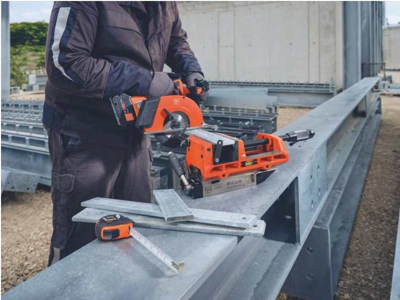
Picture caption: Rapid serial work thanks to component and depth stop for accurate drilling and cutting to length.

The high-resolution photos can be downloaded from the FEIN press area: https://fein.com/en_uk/press/