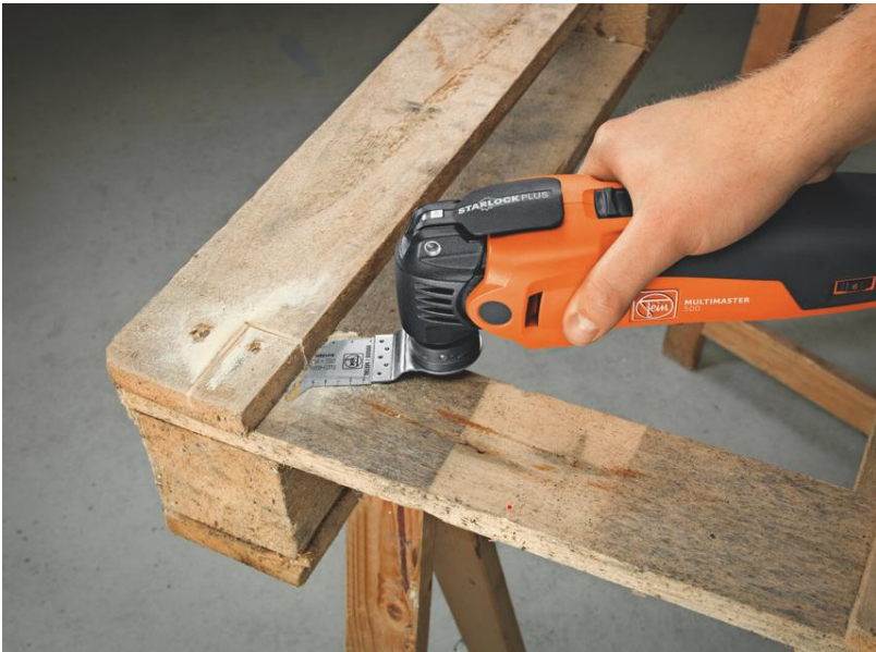
Picture caption: With the FEIN TiN saw blade, cuts in wood are made cleanly and at speed.