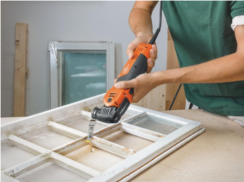
Picture caption: Precision work on a window frame with the FEIN MultiMaster and appropriate TiN saw blade.