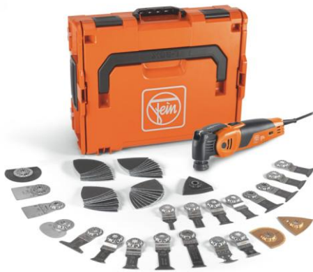
Picture caption: MultiMaster MM 700 MAX Selection with an impressive 62 accessories.

The high-resolution photos and this text can be downloaded from the FEIN press portal: https://fein.com/en_uk/press/