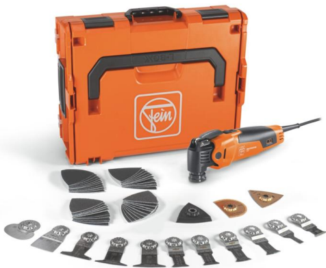
Picture caption: MultiMaster MM 500 PLUS Selection with 55 accessories for various applications.